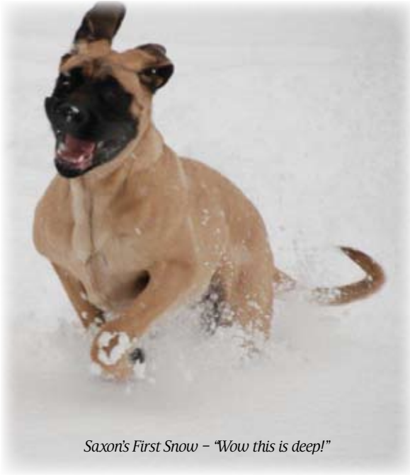
Saxon's First Snow – "Wow this is deep!"